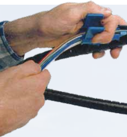
Spiral wrapping ►