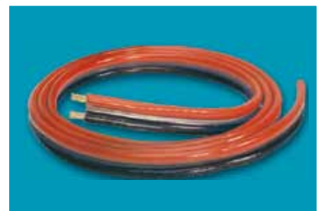
▲ Double battery cable